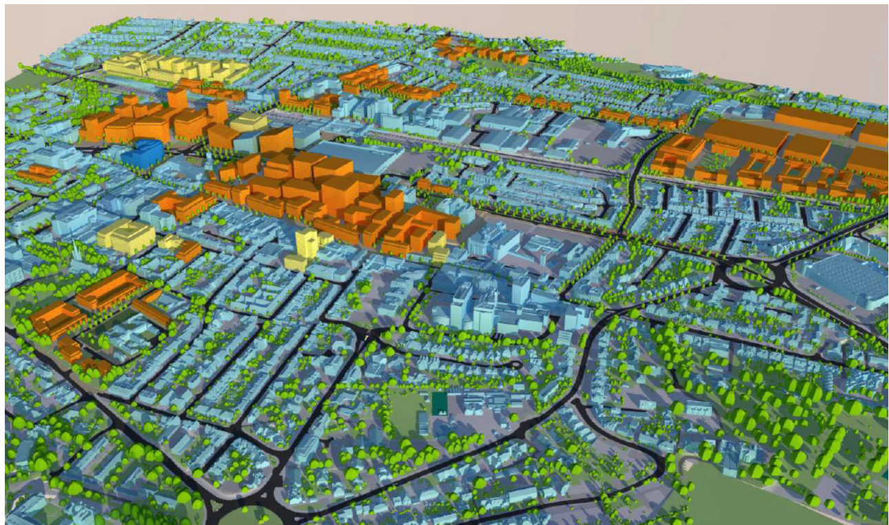
Extract from Slough Regeneration Framework - Indicative development massing in the Square Mile

5.11 A major issue within Slough's Square Mile is that many streets, beyond the High Street, do not benefit from either active frontage or enclosure and definition by buildings. The scale of redevelopment coming forward is transformative and, if coordinated, presents an opportunity to establish a coherent block structure in areas that are currently fragmented or lack permeability. The image below illustrates the scale of development coming forward and the context for the Akzo Nobel site.